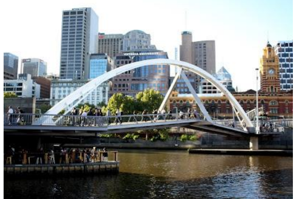
Fig.5 Sabarmati Riverfront & Melbourne Riverfront 7. The Riverfront Vision – Rejuvenating the