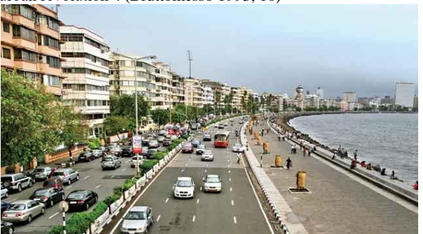
Fig.4 Marine Drive Waterfront, India (Now)

Waterfront revitalization has been the most remarkable urban development attempt in the world during the last two decades. Bruttomesso defines waterfront revitalization as a "genuine urban revolution". (Bruttomesso 1993, 10)