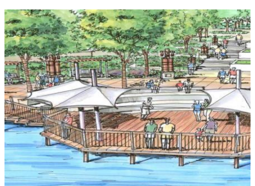
Fig.9 Development of Public Spaces

The costs of a project should be assessed given risks including those from climate change, initial capital costs, ongoing maintenance requirements, and other factors. Project designs should be assessed for the economic burden it places on owners and stakeholders. Analyses of a project's vulnerability to and consequences of changing coastal conditions due to sea level rise and coastal flooding should be considered in determining the cost-effectiveness of designs.