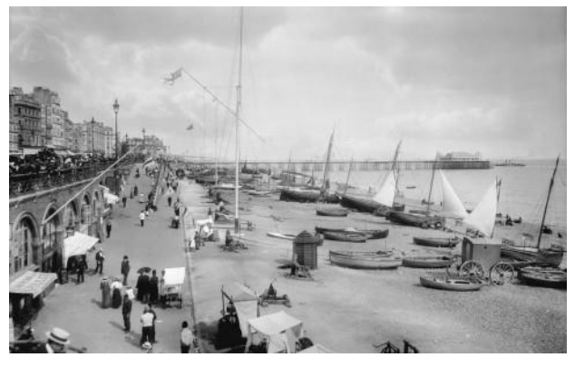
Fig.4 Marine Drive Waterfront, India (Before 1950)