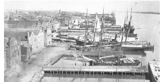
Fig. 2 Alexandria Waterfront, Virginia, US

So, phenomenon of waterfront regeneration emerged. Urban waterfront regeneration projects have become an effective tool for urban planning and politics an international dimension since 1980's.